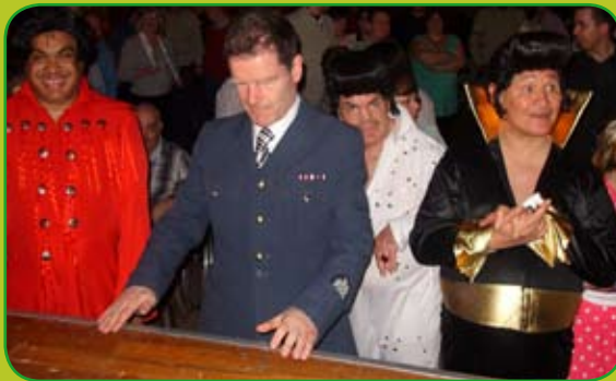
Wokingham and Bracknell had a 'Red Coats and Blue Suede Shoes' night. Everyone loved the entertainment - and you could see this by the amount of people on the dancefloor! The event was a huge