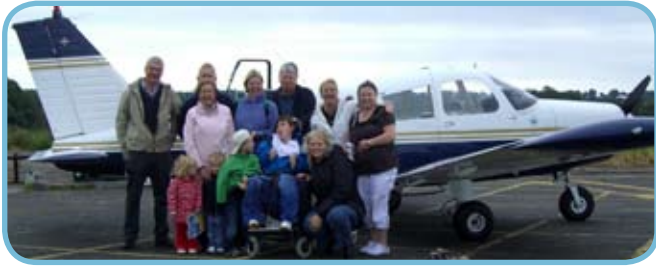
Nina with her team and family before her dream flight

The dreams competition is nearly complete - forty five dreams have come true! You can read about all of the dreams, and see the pictures at www.dimensions-uk.org/dreams .