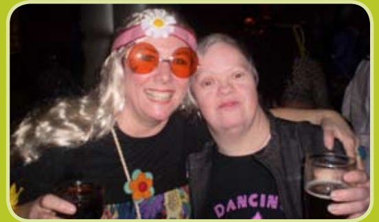
Mamma Mia...what a party! - The East Midlands region had a 70's party at their monthly nightclub for people with learning difficulties. The dancing queens shimmied all night to a brilliant Abba tribute band.