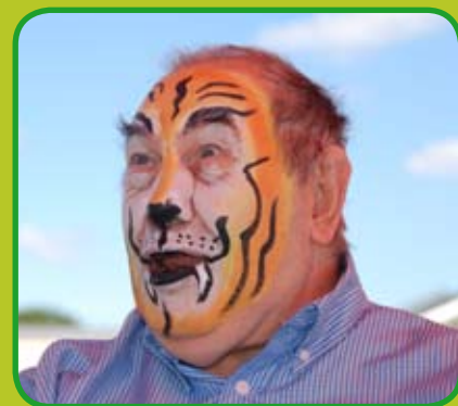
Over 600 people came to the South West's fantastic 'Festival of Fun' at Bath Racecourse. There was a live music tent, a snoozelum area, face painting, music and art therapy, a bouncy castle and lots more!